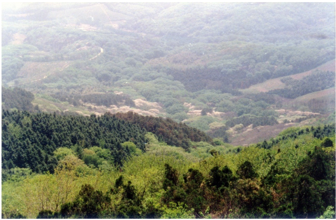
Huangfu Shan Nature Reserve (CN355) has the best preserved montane forest in Anhui, and supports subtropical bird species including breeding Fairy Pitta Pitta nympha .

Key: ● = Protected; ○ = Partially protected; ○ = Unprotected.